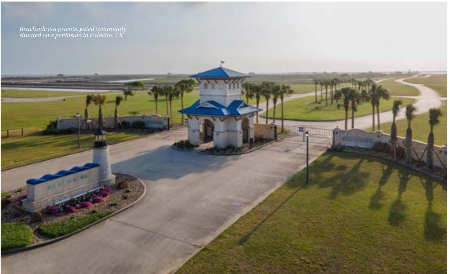
Beachside is a private, gated community situated on a peninsula in Palacios, TX.