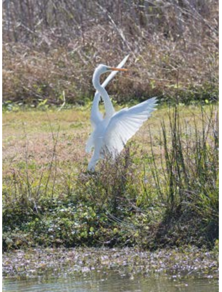
Palacios is known for its treasure trove of avian habitat on Texas’ Coastal Bend. The community enjoys a perennial number one ranking in the Audubon Society’s annual Great Christmas Bird Count event held across the globe.